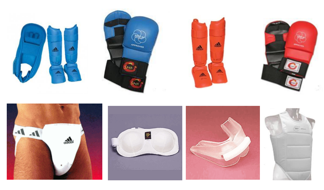
5.2.17. The all protectors for women and men shall be worn beneath the Karate-gi uniform.